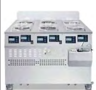
CC 600 DW