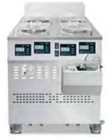
CC 400 DW