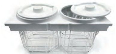
Tub holding system + lid