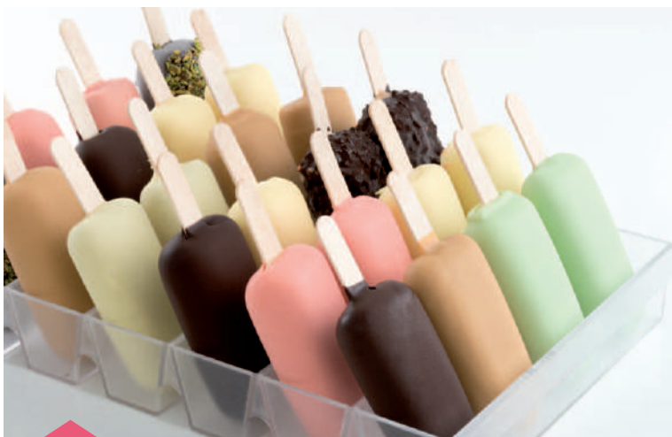
Variety of gelato on a stick