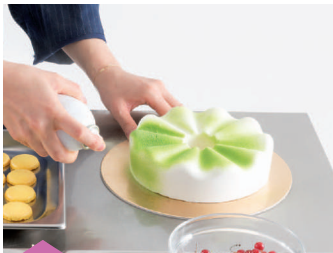
Personalization with food colouring