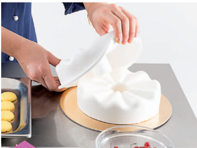
Extracting the cake from the mould