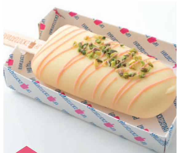
Adding value to stick treats