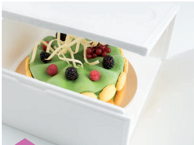
Take-away and home delivery