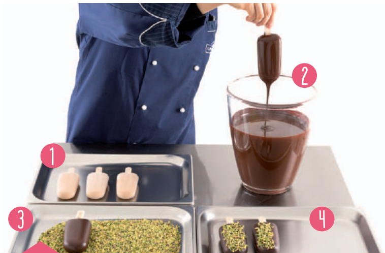
Gelato with crunches