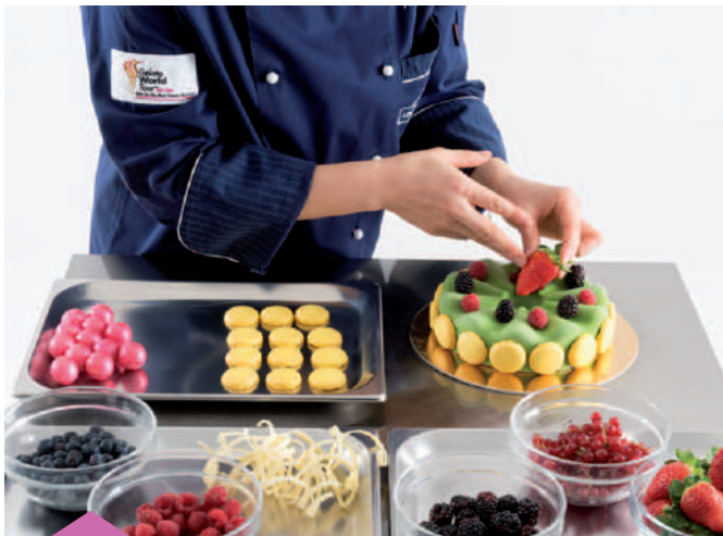
Decoration with fruit and chocolate curls