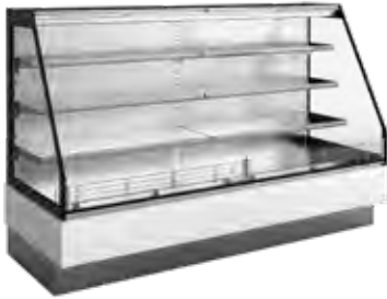
SM HF2 CC with stainless steel back