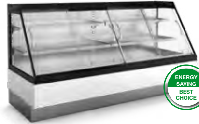
SM HF2 CP H13/15 with double-glazed glass doors