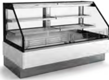
SM HF2 CC with see-through back