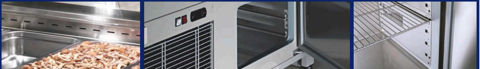
Salad/Prepared Foods Display